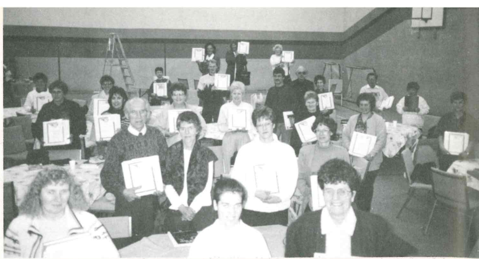
Some of the graduates holding VCI manuals.