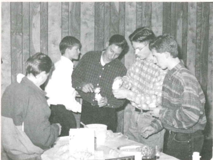
Youth relax after food drive