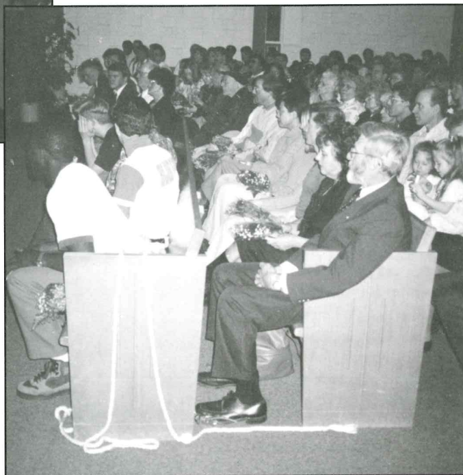
Foreground: Some of those baptized in the crusade