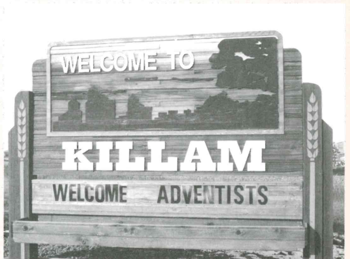
Killam warmly welcomed those attending the North East/Central rally