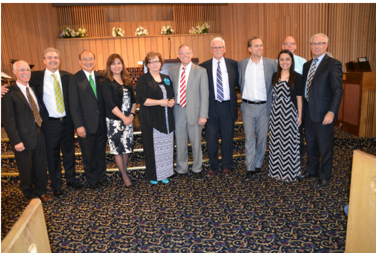
Alberta SEEDS Team with local leaders

May the richest blessings of the season be with you. As we view the harsh events in our world near the end of the year, it continues to underline the importance of the coming of the Prince of Peace.