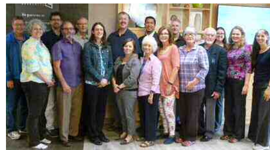
USA-Canada Union Deaf Leaders