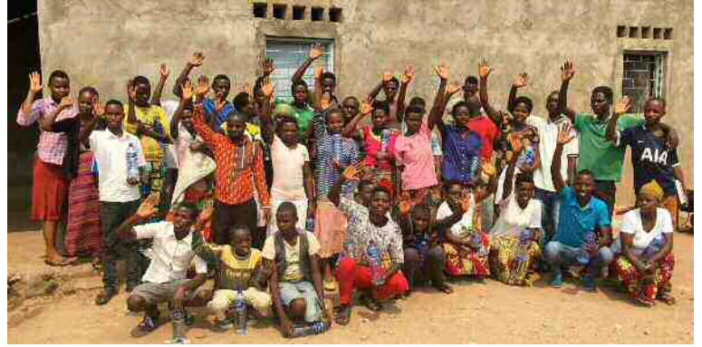
A fairly new country to GO, Burundi (above) with many new baptisms is blessed with a very active deaf GO worker for the Deaf.

At Gospel Outreach we have a special "Deaf New Work Development Fund" . One of the reasons why we have recently been able to enter a number of new countries is because of this fund. This fund has been especially blessed with some major donations- but we need all sizes of donations!