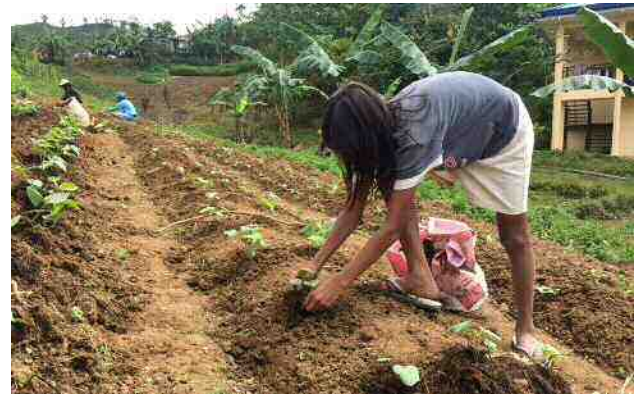
SULADS Deaf School's Garden Growing Well!