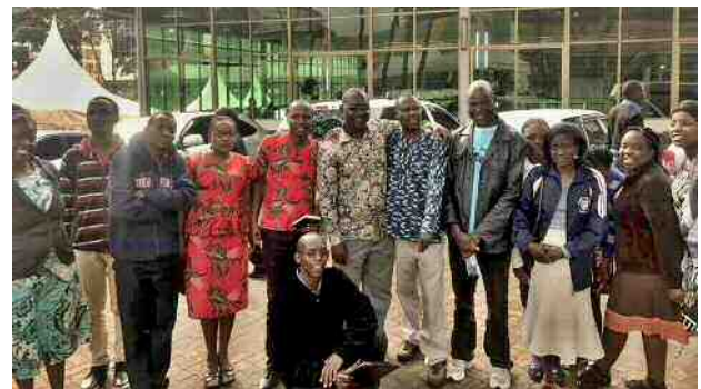
Zimbabwe SDA Group Visit Kenya to Learn/Observe