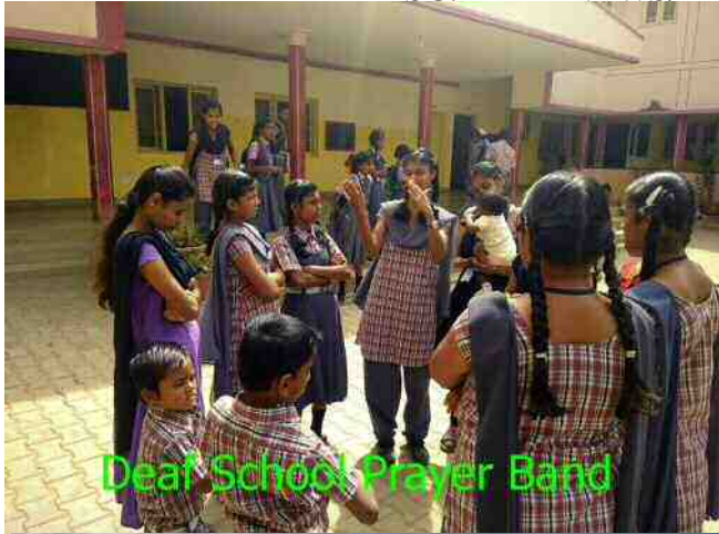
Deaf School Prayer Band