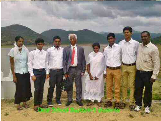
Deaf School Reception 7 students