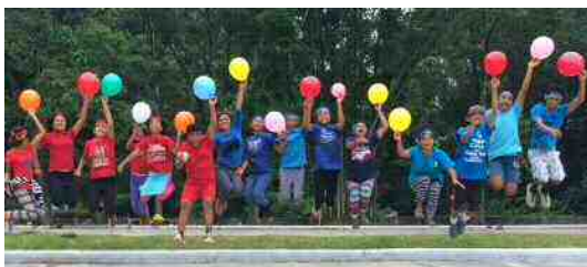
Philippine SULADS Deaf Students Celebrating