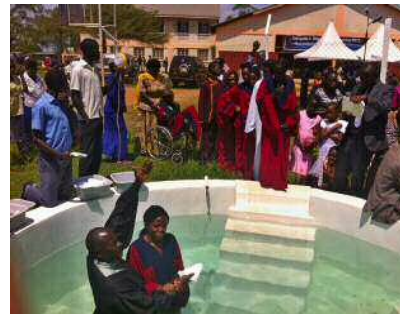
Uganda Baptism of 16 Deaf