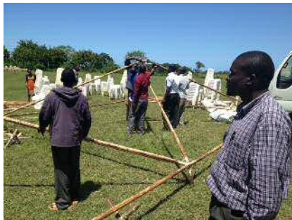
Young People Putting up Tents

East Kenya- at Kilifi (not too far from Mombasa)