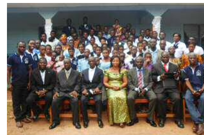
2015 Ghana Camp meeting