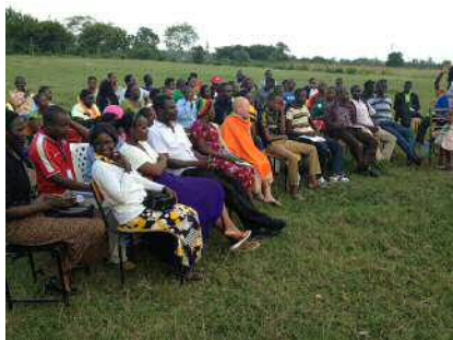
Discussion Group at East Camp Mt.