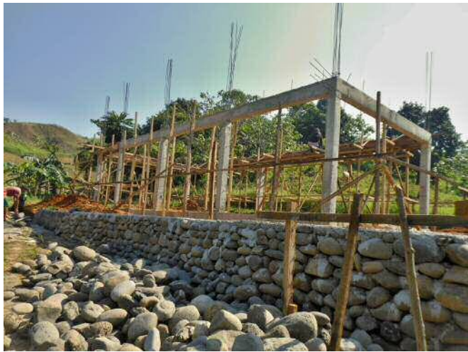
A New Kitchen and Dormitory Building Started at the Philippine SDA Deaf School