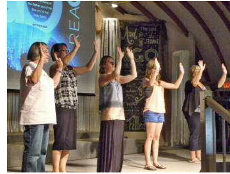
Part of the Alberta Camp Mt. Signing Class Demonstrate a Signed Song

Many contacts were made and one of these has already helped facilitate the starting of a new Gospel Outreach worker for the Deaf in Zimbabwe . Other contacts may also lead to further workers - particularly in Africa and South America. The Gospel Outreach booth was also nearby!