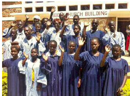
Baptism at the West Kenya Camp Mt.