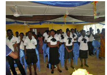
Young Deaf Dressed in the special Ghanaian Deaf T-Shirts