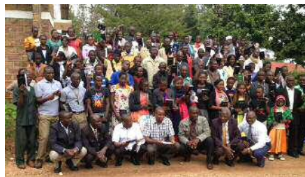
West Kenya Deaf Camp Mt. Group