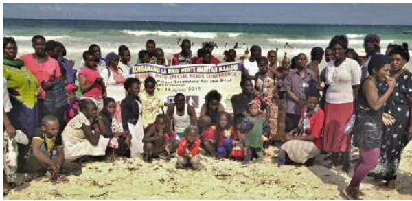
Some fun at the beach included at Kilifi in East Kenya