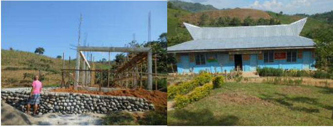
Buildings and progress in Mindanao