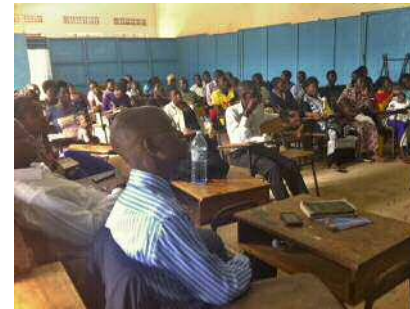
Uganda Deaf Camp Group

First ever Adventist Camp Meeting for Deaf in Uganda