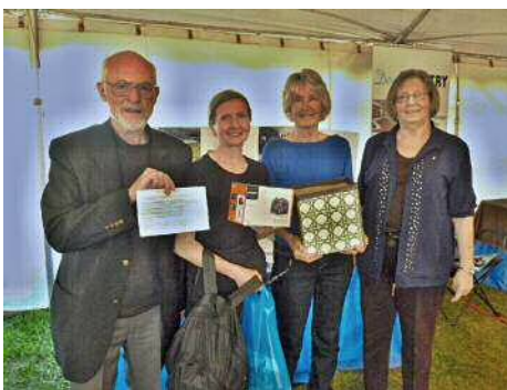
Winner of a Free Sony Digital Camera Holding Her New Camera

In conclusion we all are looking forward to taking part in the fortieth anniversary, which promises to be a very special and exciting event celebrating the forty years of camp meeting in beautiful Oregon country and will feature, we hope, a more international flavor. Yes, we have had campers from other countries such as Canada and Germany, but would very much like to welcome more international visitors.